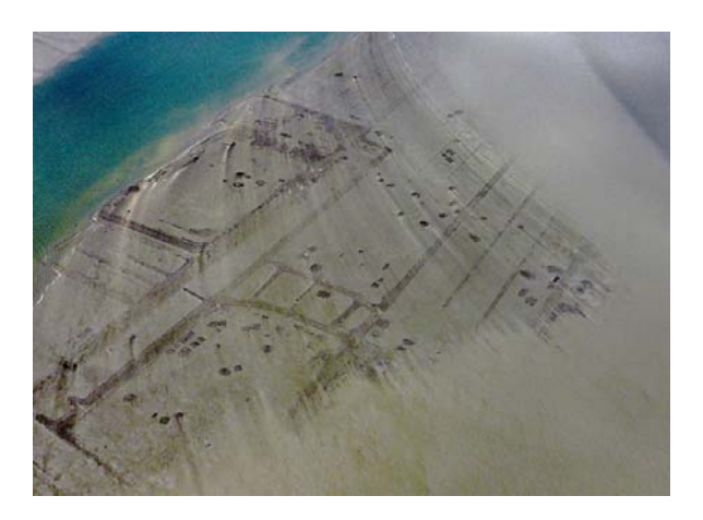
Figure 1. Aerial photograph taken on July 29, 2009, at low tide and showing residuals of former settlements in the German Wadden Sea, close to a tidal creek (upper left).

When today erosion moves away the muddy and sandy marine sediments on intertidal flats, banks of peat, old clay, and structures of farmland and settlements appear again on the dry-fallen surface. Fig. 1 shows an aerial photograph taken in July 2009 from dry-fallen intertidal flats north-east of the German island of Pellworm. Clearly visible are linear structures that witness the historical land use, before the great "Mandränke". Also visible is the sandy sediment, by which those structures were buried, and which was driven apart by the action of currents and waves.