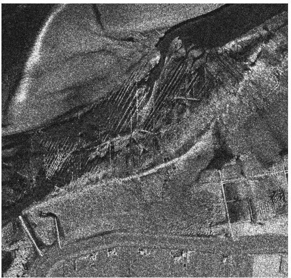
Figure 4. Section (1900 m \times 2000 m) of a TerraSAR-X image of dry-fallen intertidal flats north off Pellworm. Residuals of historical land use can be delineated through linear bright and dark structures.

Results from our field campaigns prove that it is the former system of ditches that causes the distinct signatures on the SAR imagery. The change in surface roughness, together with the high-resolution capability of TerraSAR-X